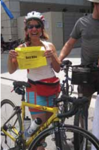
"OMG, I WON!!" All season long, many a lucky bike parking customer returned to find a surprise award tucked into their spokes.