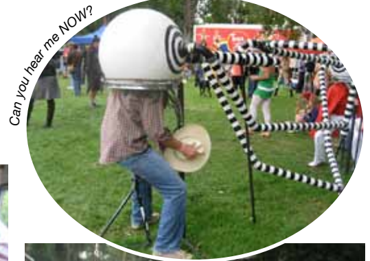
Can you hear me NOW?