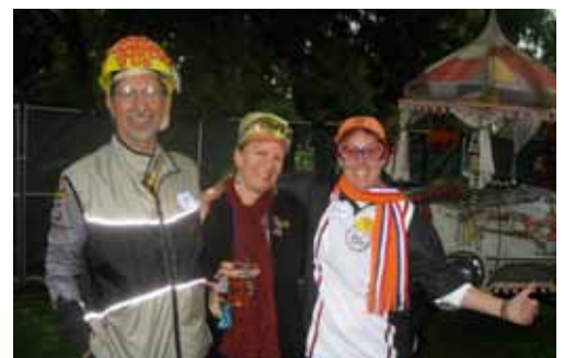
Exhausted but still smiling after a long day of slinging beer and herding Fats.