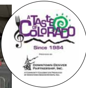
Intrepid Taste of Colorado bike parking volunteers put in many hours over the Labor Day weekend, fueled by mini Cliff Bars and kettlecorn, and supplemented with free food & drink tickets.