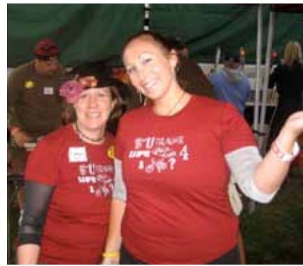
It's not raining... yet!