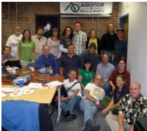
Left turns on red, Cyclovia-style car-free days, and promoting awareness and civility in our Front Range canyons were some of the campaigns developed by these hard-working folks. BikeDenver's team included members from The Bike Depot and Mayor's Bicycle Advisory Committee.

In early October, The Alliance for Bicycling & Walking partnered with BikeDenver to bring their signature Winning Campaigns® Training to Denver. Bicycle and pedestrian advocacy leaders from California, Colorado, Minnesota, New Mexico and Utah learned from expert coaches and each other before choosing specific campaigns to increase bicycling and walking. After three days of fun and inspiring work with the country's leading experts in advocacy, BikeDenver's team chose a campaign to promote the installation of a fully-functioning "Bike Hub" (including shower and changing facilities, as well as repairs, rentals, and retail) as part of the Union Station Redevelopment project.