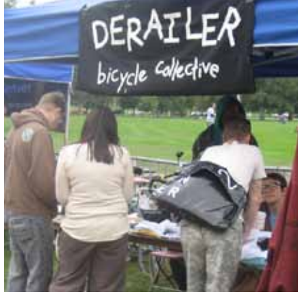
Paraders register with the Derailler folks.