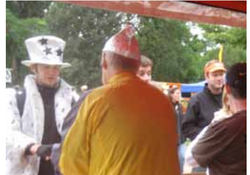
"Pick an ID card, any card..."