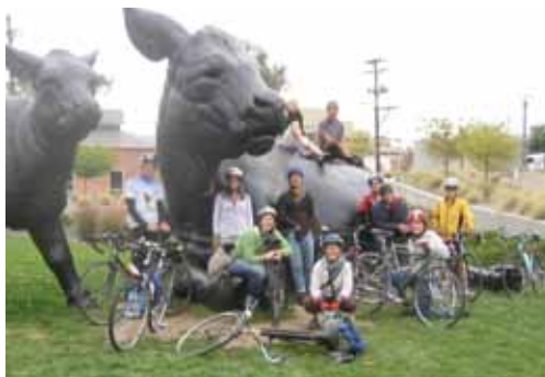
Winning Campaigns classmates took time out for a Saturday evening ride along the streets and bikeways near downtown Denver. After posing with these fine bovines, we stopped for refreshments at Little Man Ice Cream, one of our favorite Bicycle-Friendly Businesses.