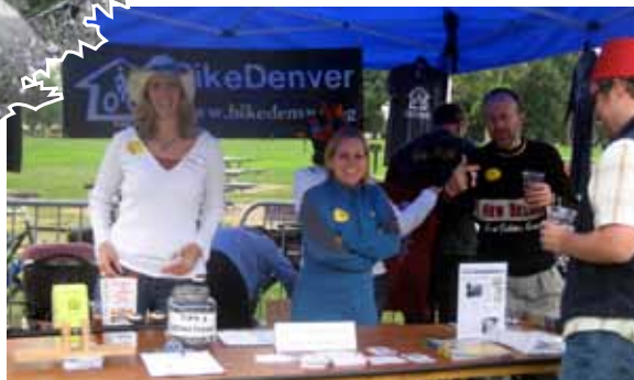
Keeping it real at the BikeDenver booth.