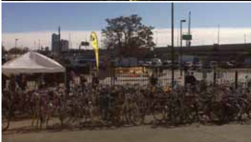
While there wasn't quite as much business at VeloSwap this year, the parking corral outside and the BikeDenver booth inside—which again offered free parking for your purchases and/or backpacks—enjoyed continued growth over years past.