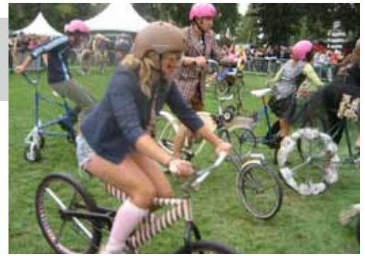
This circular parade went on all day in the midst of the festivities, and a long line of revelers waited to try out all the goofy rides.