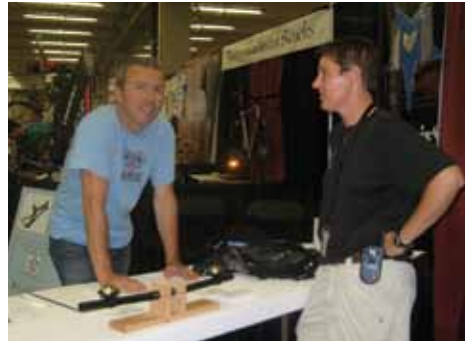
Take this Maverick M&B Frame home today!